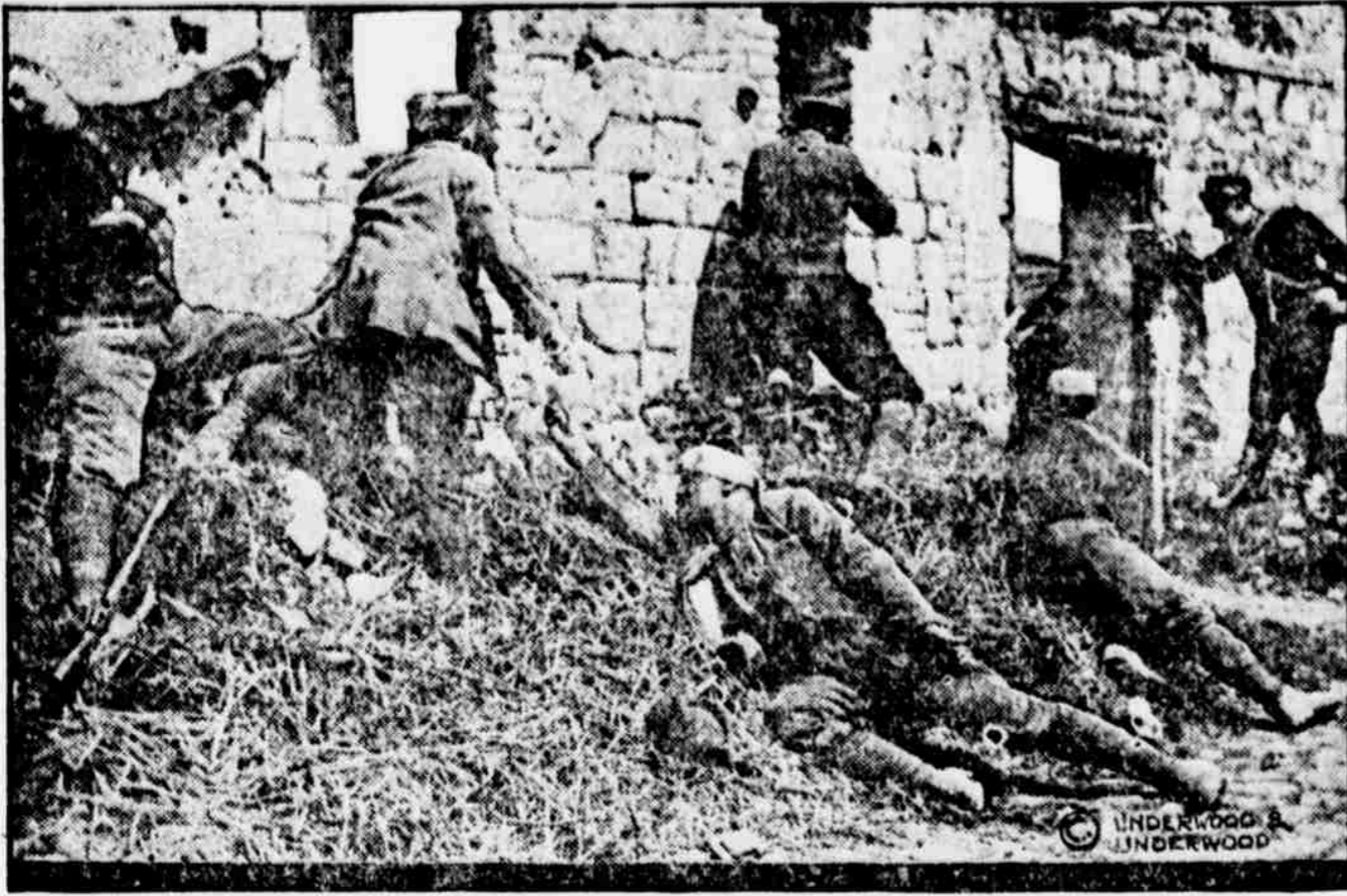
One of the most sensational war pictures taken up to this day. It was granted first prize at the war photographic exposition held in Paris. Several French soldiers trapped by the enemy in a ruined village in Alsace are defending themselves down to their last cartridge. Note the wounded soldier handing his last bullets to one of his companions. An officer just hit can be seen dropping his rifle.