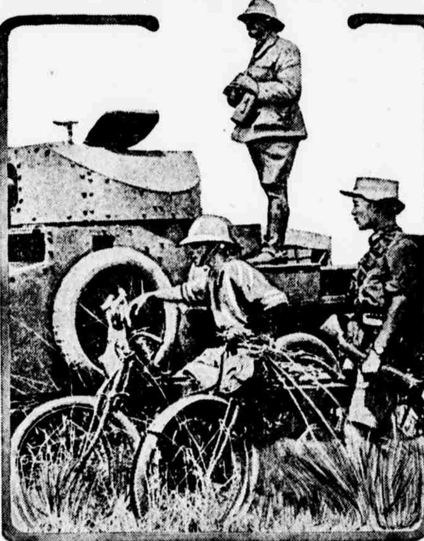
General Smuts, commander of the British forces in East Africa, making observations from the top of an armored car. It has been officially reported that General Smuts has occupied Dar-es-Salaam, the chief town of German East Africa, and a principal seaport.