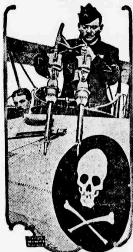
On this French reconnoitering aeroplane two machine guns joined together are mounted behind the pilot. The skull and crossbones indicate the feeling of the aviators.