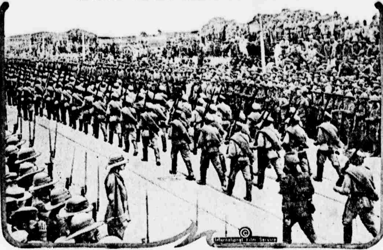
First photograph showing the Russian forces entering Saloniki. They are marching through streets banked with French, British, Serbian and Greek soldiers.