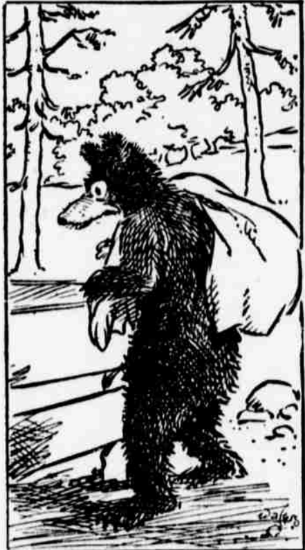
Put the Bag Over His Shoulder and Walked Off.

Thought His Time Was Come. "Sufferin' cuts, I thought my time had come, sure! A big black 'n' riz right up stiddy on his hind legs an' looked at me. He looked's big ez a mounting there in the twilight, an' I was so blame skeered I stood still in my tracks without sayin' a word. He stood there an' grunted, an' then picked the fattest shote I had up under one arm. I was countin' considerable on that shote, but I didn't dare to say any-