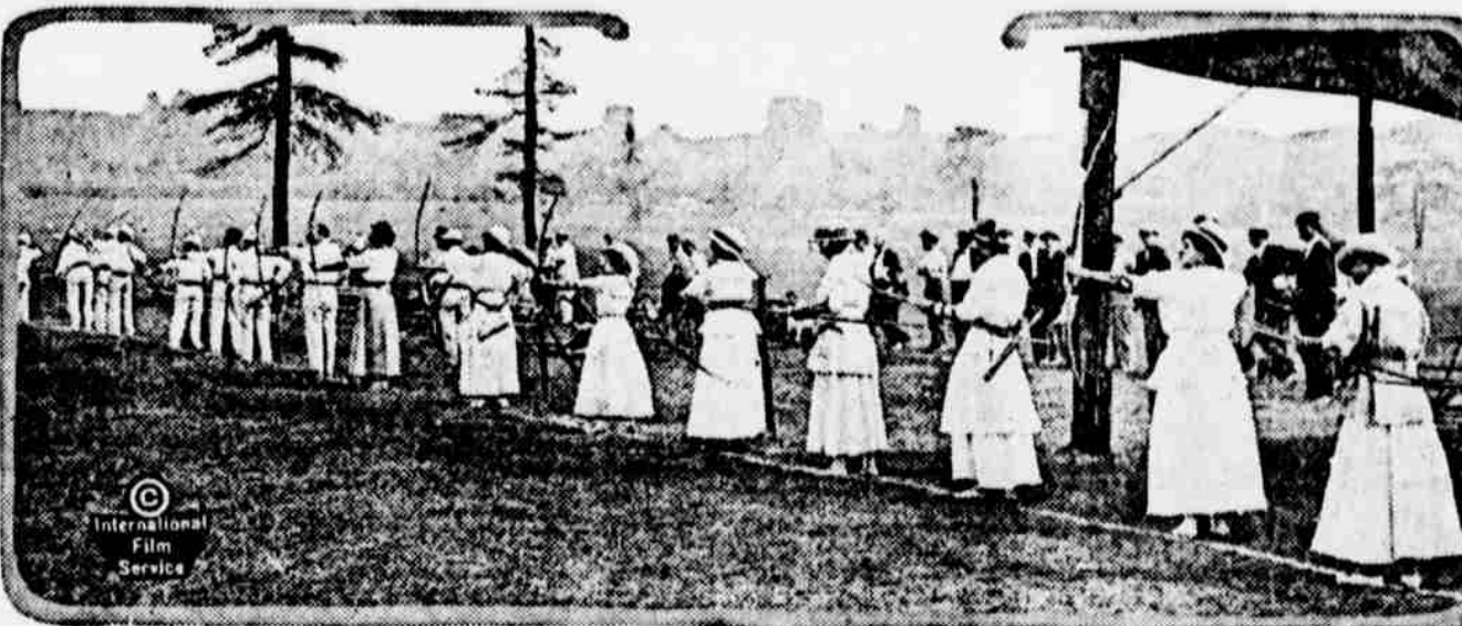
For the first time in a generation residents of New York and vicinity recently had an opportunity to see handled by the country's best experts the ancient weapons that laid Achilles low and were the dread of the early American colonists in their wars with the Indians. The thirty-eighth annual tournament of the National Archery association was held at the Hudson county range in Jersey City, N. J., with a goodly representation of both gentlemen and lady archers from all parts of the country.