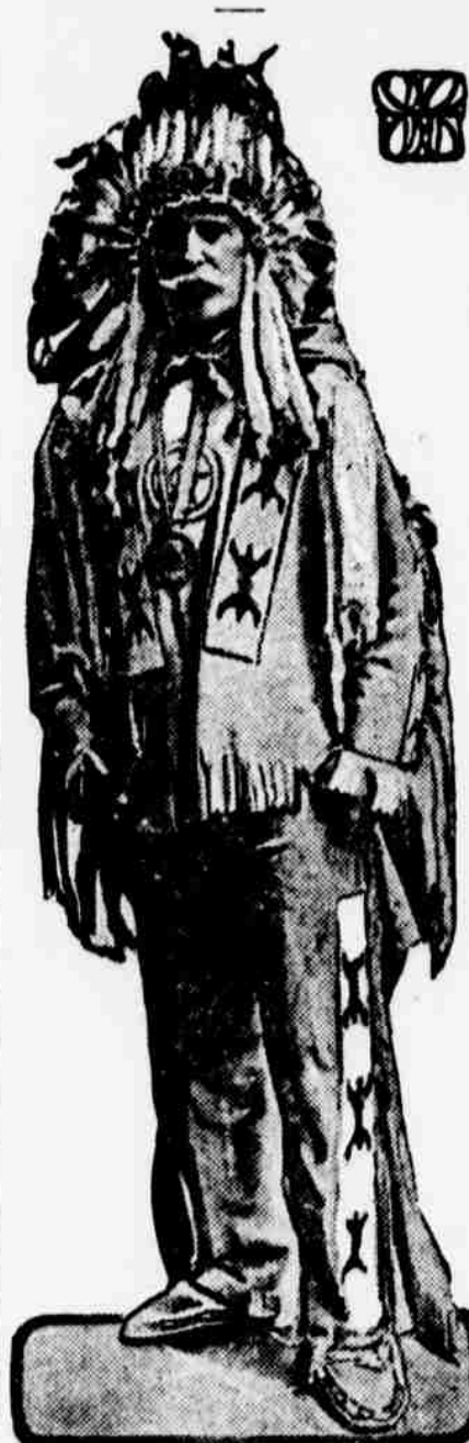
The duke of Connaught, governor general of Canada, in war paint at Banff, Alberta, where the Indians made him a chief the other day.