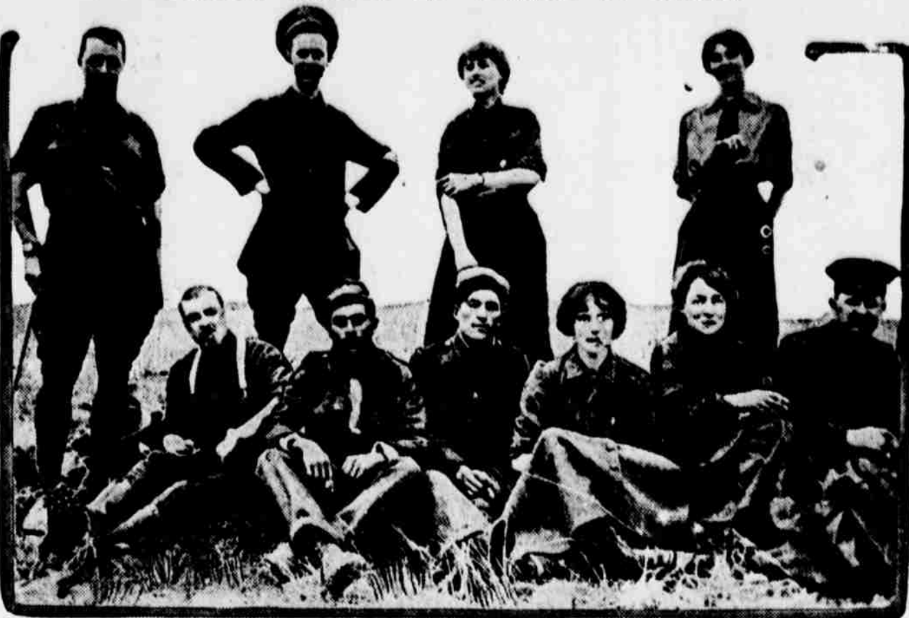
These are nurses of the First British field hospital for Serbia, photographed outside Saloniki, Greece, and accompanied by two Greek officers.