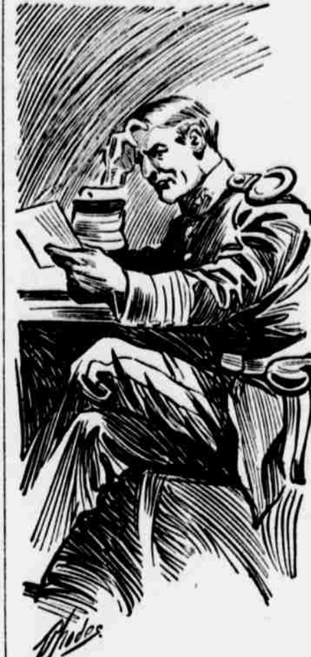
"Good Heavens! It's Not From the Army. It's From the Grave!"

"Yes, sir. The orders not to disturb them are quite positive, and as a junior I could not do so except by their orders as superiors. The chief, before retiring, however, repeated to me, in case any inquiry came from you, sir, that there was nothing he could add to the staff's message to the nation and the army. It is to be given to the