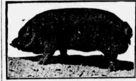
Head of Herd of Duroc Jerseys.

The chief points to be desired in a brood sow are set forth in farmers' bulletin 205 of the United States department of agriculture, published under the title of "Pig Measurement." The sows selected should be nearly ive sample size bottle by neck moderately thin and the shoul- It will be a strengthener and will make ders smooth and deep; the back should the colt's hair sleek and glossy. be fairly wide and straight, and ample