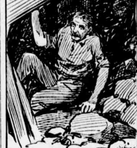
The Planks Overhead Allowed the Dirt to Fall Gradually.

That Skuskik's escape was miraculous is indicated by the situation in which he was found, one foot pin-