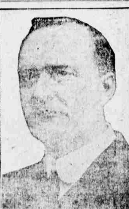
lican and Progressive Tickets for Renomination.