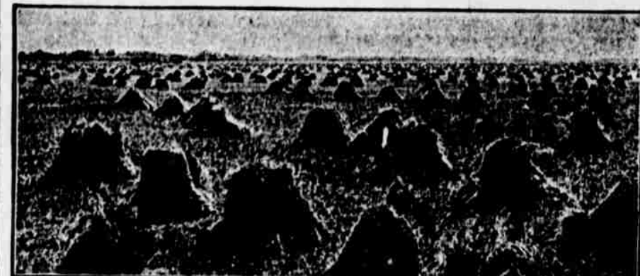
Wheatfield In Stook, Western Canada.

and had a stand fully as good as any bile trip to the north and west of the country had ever produced; the heads city, over twenty-seven miles being were large and the prospects were of covered. Several fields were seen