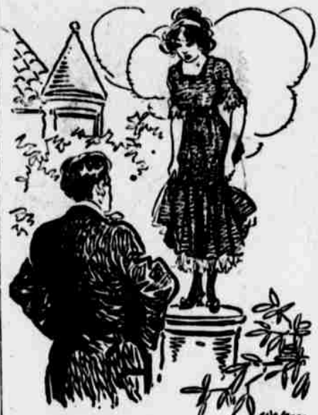
"I Wouldn't Do That."

"Help me down this instant," imperatively demanded Philada. "You look very graceful up there," he replied, lazily. "I rose to leave the arbor, but sank back at the sight that met my eyes. For there was Philada perched upon the high pedestal, from which the storm had blown the fern the night before, and on the grass facing her sat Larry. Larry is six feet three and no doubt had tossed her up as he would a child. "Help me down," she commanded. "I must return to my studio next month. I have been thinking the matter over, and concluded I should like to take you back with me as my