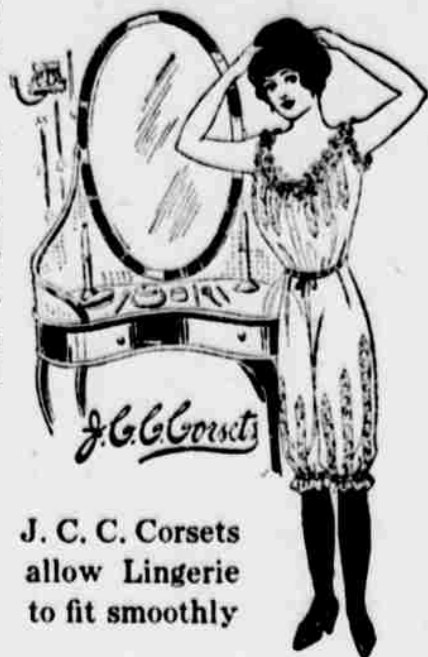
J. C. C. Corsets allow Lingerie to fit smoothly

The Lingerie should be of fine, soft materials with laces and embroideries of fine texture. Materials for the summer underwear may be had here at the most reasonable prices. In fact, the entire summer outfit means only a small expenditure.