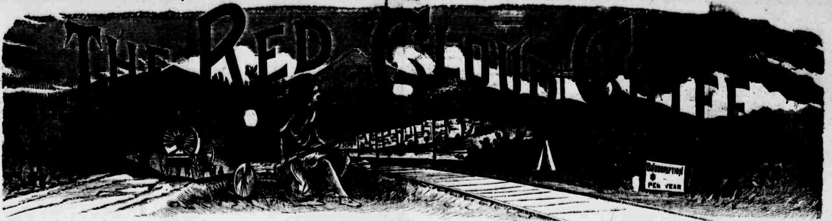
A Newspaper That Gives The News Fifty-two Weeks Each Year For $1.50.