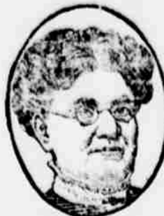
"I Feel Like a New Woman"

If you have catarrh and are neglecting it—you are doing a great wrong to yourself. In time it will undermine your whole constitution. You cannot begin too soon the work of shaking it off. Doesn't require any great effort. Begin today.