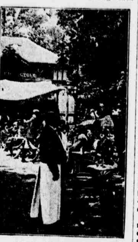
Parisian Boulevard Cafe.

might be classed "bocks" and "aperitifs." Now, it is a recognized fact that these last mentioned are, nine times out of ten, extremely harmful to the stomach, and certainly do little or nothing toward stimulating the appetite or aiding digestion. On the contrary, they often prevent both. Nevertheless, few Parisians can resist the temptation of interrupting their afternoon stroll, and they are soon installed with their favorite mixture in front of them. As to the cafe's being the only place where one can really smoke, I am sure that the bland and benign smiles of numerous solitary men, who can be found at all hours of the day and night, sitting wreathed in the fumes of their long cigars and pipes, are sufficient to corroborate the statement. "There was a time when 'cafe' meant a place where one could obtain that with which to quench one's thirst, but one after another the different establishments have added a restaurant, until now in the more cosmopolitan quarters there is hardly a real cafe left. Maxime's, Larue's, Weber's and the Cafe Viennois and Dukas, can all be classed under this head. In fact, the word cafe seems doomed to become obsolete in Paris, for 'bars' on the American plan, 'brasseries' where German delicatessens are served, and 'tavernes' with their specialties have worked their way in little by little and have now become fixtures.—Mme. Huard, in Scribner's.