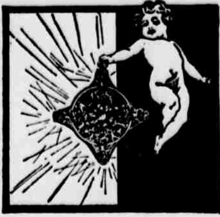
DIAMOND RING--VALUE $100.00

This Ring is offered as the 2nd Prize in The Chief's Big Automobile Contest. It can be seen at the E. H. Newhouse Jewelry Store.