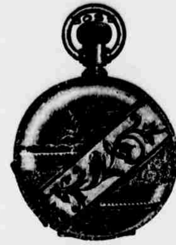
WALTHAM WATCH--VALUE $50.00