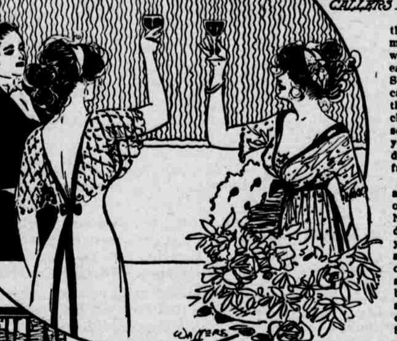
THE HEALTH OF THE NEW YEAR!"

reading of the stars. It furnishes standard time for half the world, and as the new year is born will send its message clear up to Alaska, to South America, to China and to London.