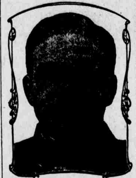
Manuel, former King of Portugal, was taken seriously ill on his way from Vienna to Moscow.

ties around that city on Tuesday and Wednesday. Bayonets were used freely in the fight for the possession of the banks of the Tuna river and hundreds were killed or wounded.