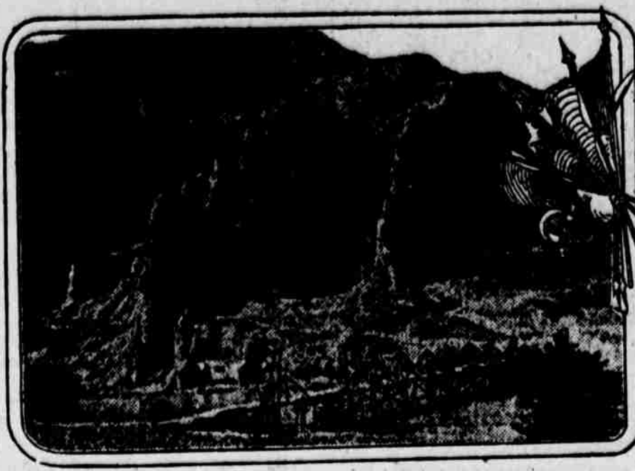
THIS illustration shows a fair example of the country along the Turkish-Bulgarian frontier. Here the hard strata or dykes, denuded by rain, appear as natural walls above the Isker river and afford unusual cover for military operations.