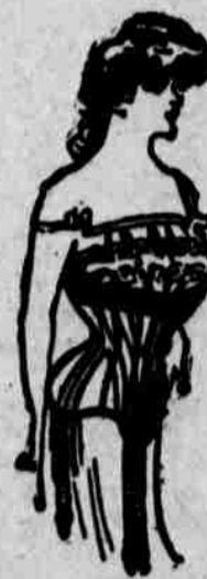
AMERICAN BEAUTY Style 628 Kalamazoo Corset Co., Mahara