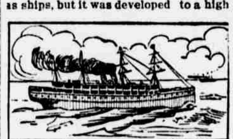
A Tramp Steamer.

The business of tramping is as old as ships, but it was developed to a high