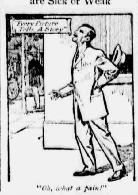
"Oh, what a pain!"