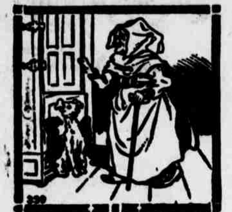
Because there's bakin' there!

Old Mother Hubbard Went to the cupboard To get her poor dog a bone. But she was mistaken For she had ordered some Bacon of us that morning. And so the poor dog had none!