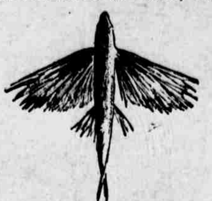
A Flying Fish.

In point of size, these fish range from 6 to 16 inches. They skim along the surface of the sea, and, at brief intervals rise above the waters and indulge in short flights through the air. In length and height these flights vary, much depending apon the state of the weather, the