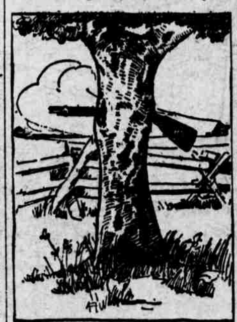
Gunbarrel in a Tree.

About ten feet up, at what was probably one time the fork in the tree, since grown into a solid trunk, an old barrel sticks out at one side. stock protruding from the other. On the stock is cut the initials "J. P." The general belief is that some one left the gun in the old crotch of the tree and forgot it, and in the years