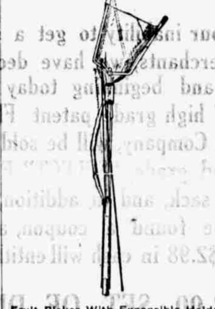
Fruit Picker With Expansible Holder.

To prevent fruit from being bruised when picked, a fruit picker with flexible holder has been invented, in which provision is made for varying the capacity of the holder to obviate the necessity of dropping the fruit to any distance, says the Scientific