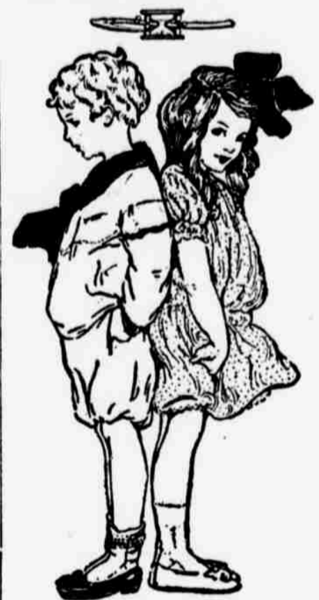
About even now, but which will be the taller when next New Year's day comes?

"Old year, you shall not die; We did so laugh and cry with you, I've half a mind to die with you, Old year, if you must die."