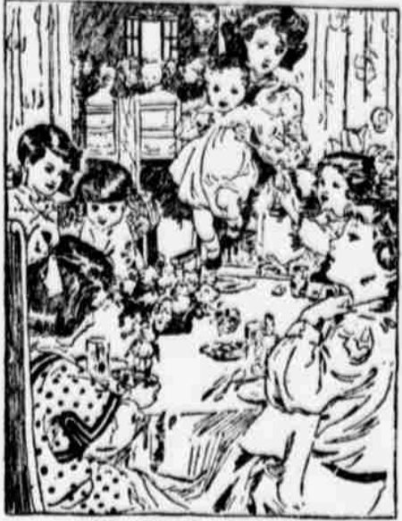
The Children's Table.