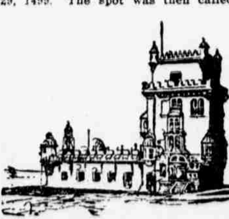
Tower of Bethiehem.

Vasco de Gama embarked from Belem on his memorable voyage to India on July 8, 1497, and safely disembarked at the same point on July 29, 1499. The spot was then called