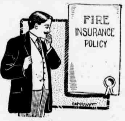
Don't Delay Ordering

a fire insurance policy from us a single day. Fire isn't going to stay away because you are not insured. In fact, it seems to pick out the man foolish enough to be without