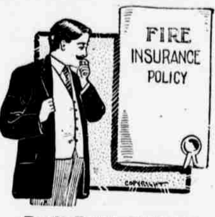
Don't Delay Ordering

a fire insurance policy from us a single day. Fire isn't going to stay away because you are not insured. In fact, it seems to pick out the man foolish enough to be