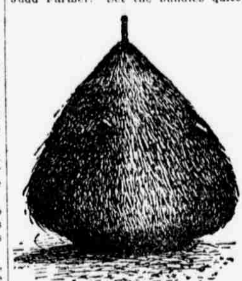
Model Grain Stack.

Now lay a bundle to one side, within easy reach, and have the pitcher pitch on this. It will prevent the loss of the grain, which shells out in handling the bundles. Set a shock where the middle of the stack is to be and keep on adding to it equally from all sides, says a writer in Orange Judd Farmer. Set the bundles quite