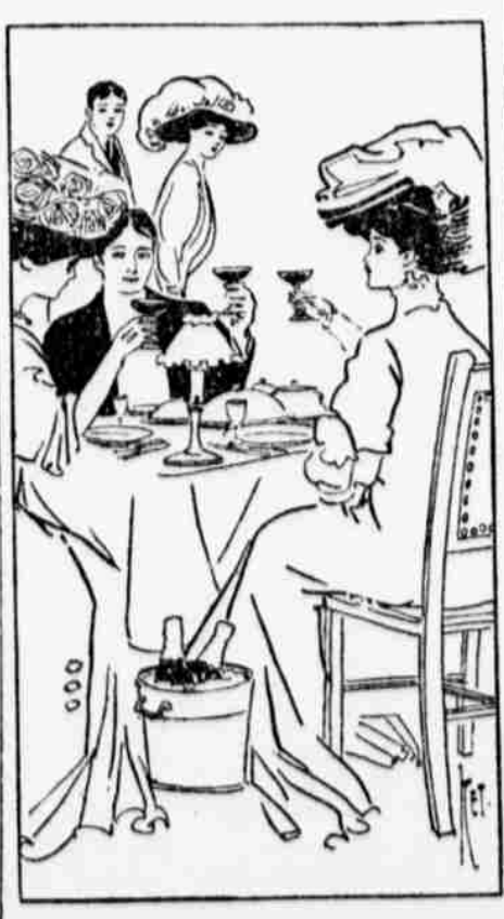
Rich Women, by Bad Example, Are