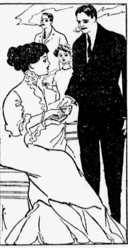
Husbands Are to Blame.