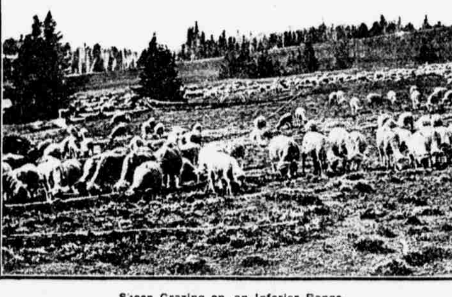
Steep Grazing on an Inferior Range.

able remedy for this trouble is life In the initial stages three different seed oil given as a drench in amounts methods of reseeding were used. Upon from one to two quarts. The oil apone area the seed was allowed to pears to overcome the injurious ef-