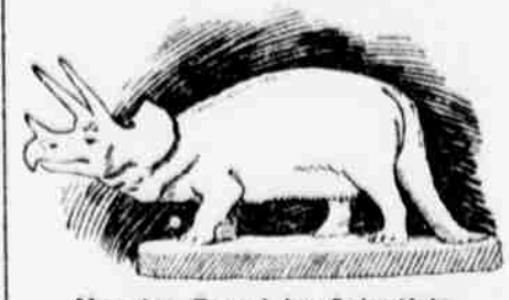
Monster Found by Scientists.

Two expeditions were sent out early last summer under the direction of the field of the department, Prof. Henry Fairfield Osborn, who is also president of the museum. The first, which was