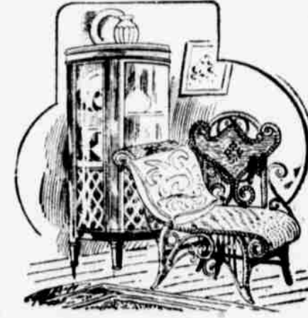
A Model Dining Room We Can fit it for you.

While our Stock is Complete a Word to the wise is Sufficient.