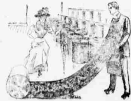
This Department is complete in Carpets, Rugs, Lace Curtains, and Draperies.