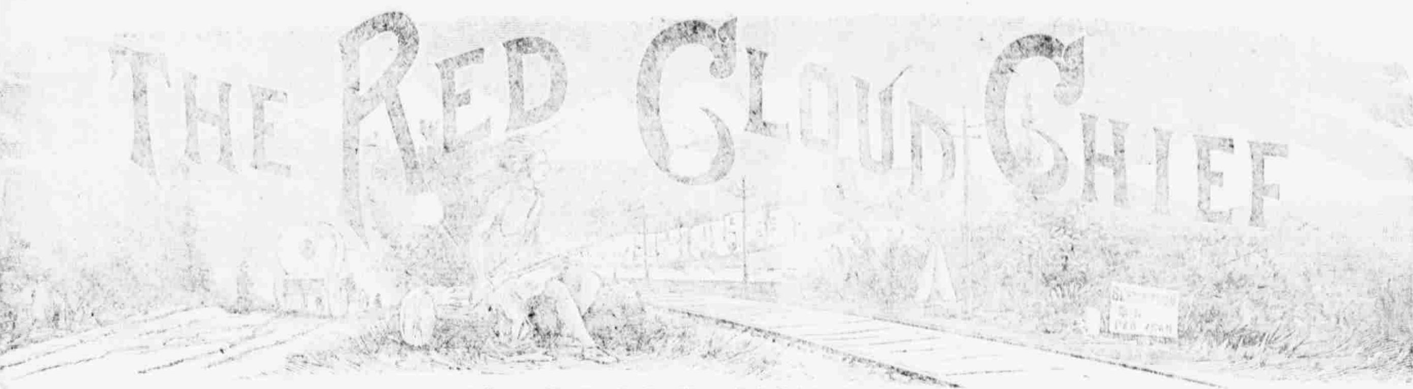
A Newspaper That Gives The News Fifty-two Weeks Each Year For One Dollar.

Your idle money should be invested in our 3 per cent Certificates of Deposit.