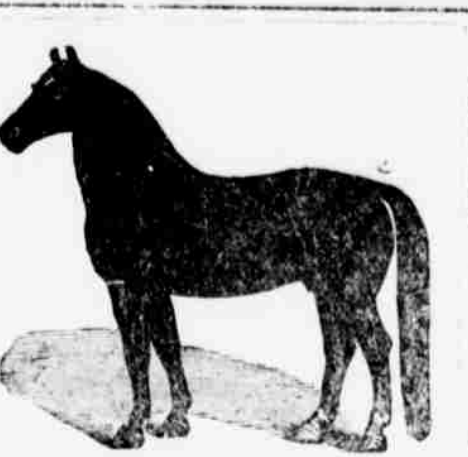
The Standard Bred Trotting Stallion Oscar Wagner, No. 30507

Kodol is a perfect digester. If you could see Kodol digesting every particle of food, of all kinds, in the glass test-tubes in our laboratories, you would know this just as well as we do. Nature and Kodol will always cure a sick stomach—but in order to be cured, the stomach must rest. That is what Kodol does—rests the stomach, while the stomach gets well. Just as simple as A, B, C.