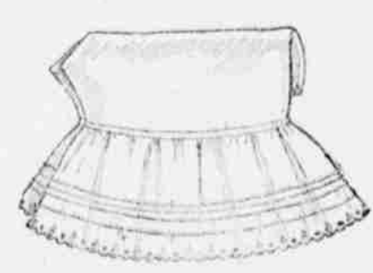
Ladies' Lace Trimed

Children's extra quality Drawers with tuck or lace trim at 25c.