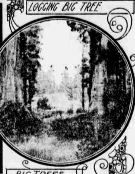
FIRE SCAR IN A BIG TREE