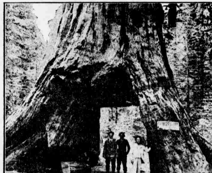
Pioneer Cabin. The Hollow Butt is Exposed in the Roof of the Driveway.