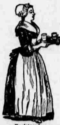
Registered U. S. Pat. Office

It takes a has-been a long time to find it out.