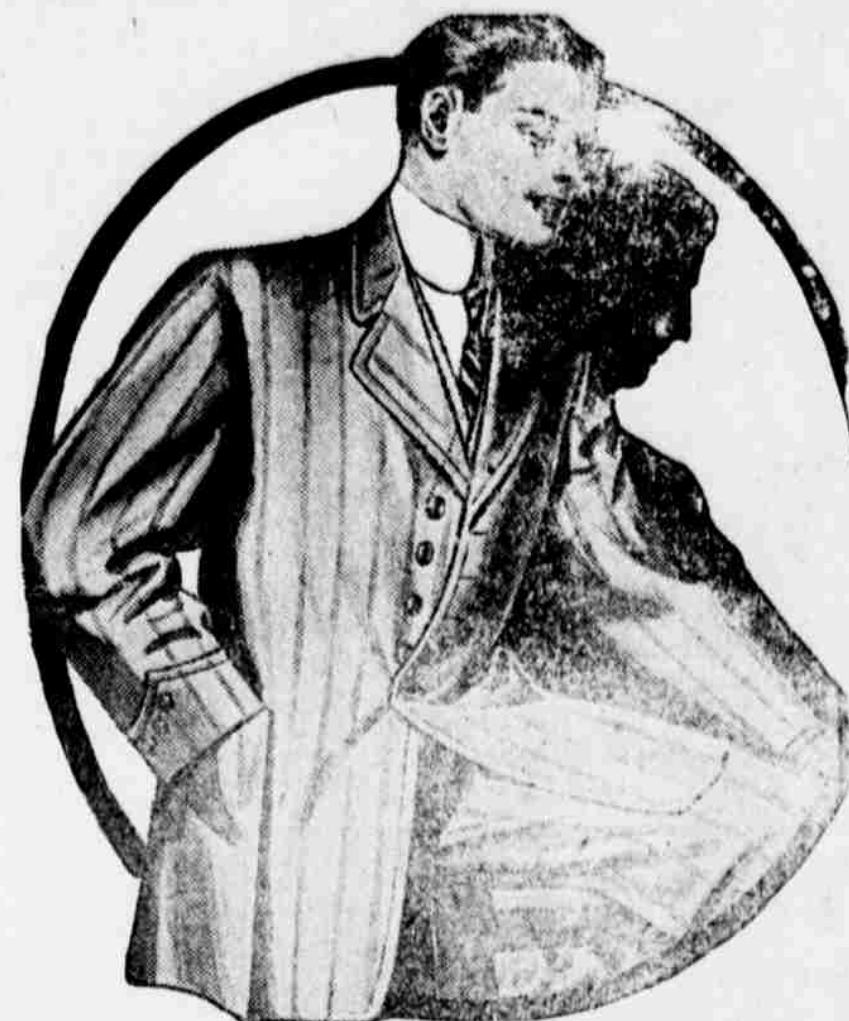
Ederheimer, Sevin & Co.

We have long pant Suits for Young Men of the Hour. The making of Clothes for these Smart Young Dressers has become an art.