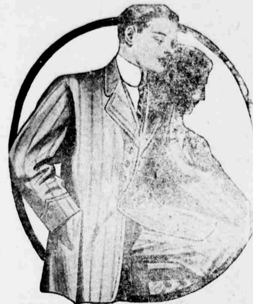
Ederheimer, Sein & Co.

We have long pant Suits for Young Men of the Hour. The making of Clothes for these Smart Young Dressers has become an art.