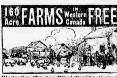
Illustration Showing Mixed Farming Scen