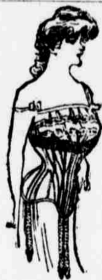
AMERICAN BEAUTY Style 628 Kalamazoo Corset Co., Makers

She knows she looks well then, that she is charmingly attractive and that her beauty is greatly enhanced because she is wearing a corset that produces such magnificent results.