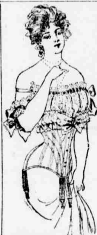
AMERICAN BEAUTY Style 786 Kalamazoo Corset Co., Makers

A woman is conscious of her superior appearance when she is wearing an