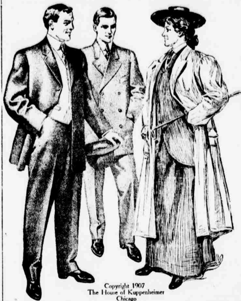
Copyright 1907 The House of Kuppenheimer Chicago

We point with pride to our choice selections of