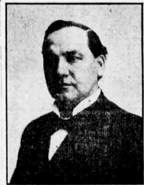
SENATOR E. J. BURKETT, Who Will Speak at the Catholic Church Next Tuesday Evening.