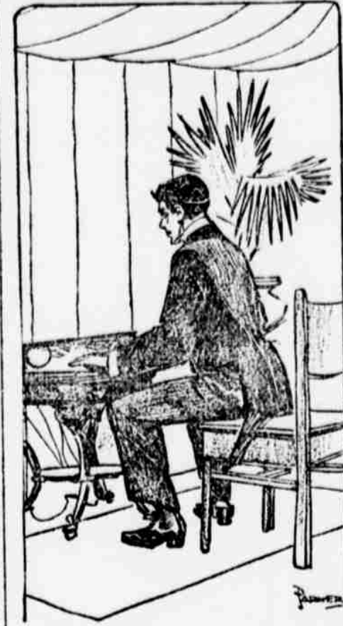
"You must take off your rings."

with unusual quickness—the obstacles to and the need for a speedy decision. He glanced round the tent; then unconsciously he straightened his shoulders.