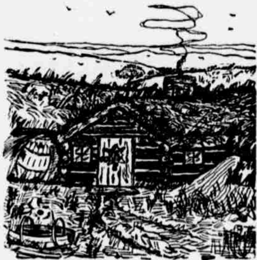
"No Place Like Home" Pioneer Home in Webster County Thirty Years Ago.

HOME SEEKERS' RATES Over the Burlington route in force on the first and third Tuesday of each month, one fare plus two dollars for round trip.