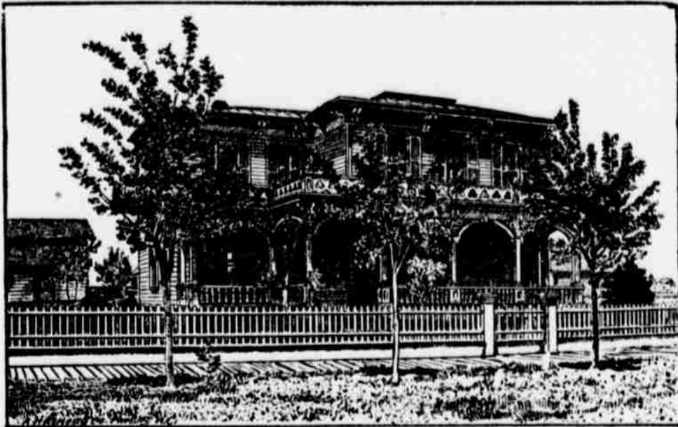
"NO PLACE LIKE HOME." Modern Home of today.

DO YOU WANT TO BUY, SELL OR TRADE? Do you want a Farm, or a nice home, or Merchandise Stock of any kind? If so we can furnish it, or trade it.