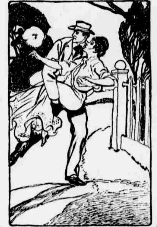
The rifle rang out again.

He dropped her wrists, caught her up in his arms as if she had been a kitten and leaped into the shadow of the trees that leaned over the road from the yard. The rifle rang out again. and the little ball whistled venomously overhead. Harkless ran along the fence and turned in at the gate. A loose strand of the girl's hair blew across his cheek, and in the moon her head shone with gold. She had light