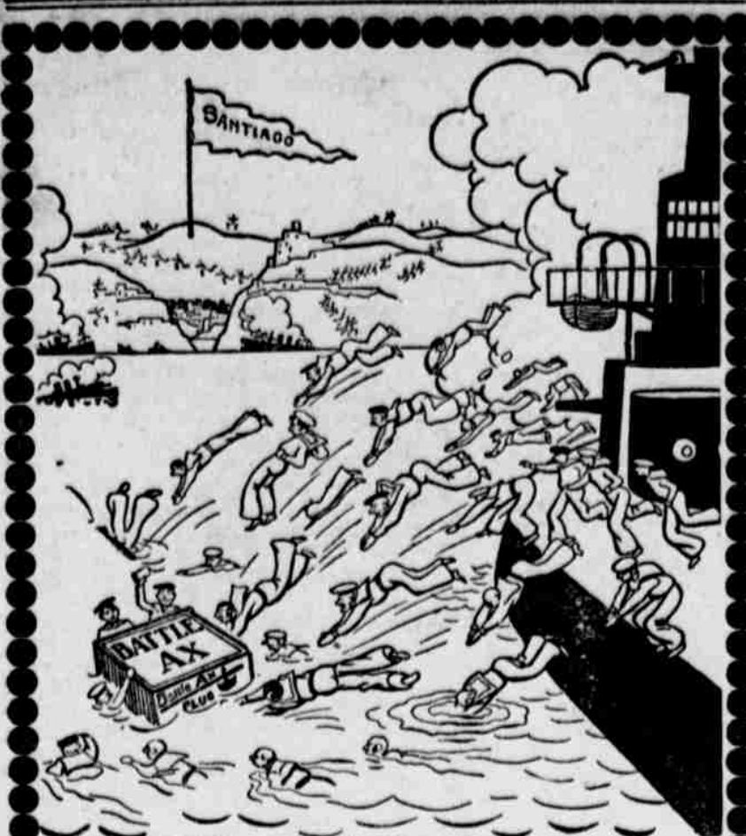
To the Rescue.

"BattleAx PLUG was in danger there would be an army of men (who chew it) ready to rescue it:—large enough to shovel Spain off the map of Europe. No other chewing tobacco in the world has ever had so many friends.