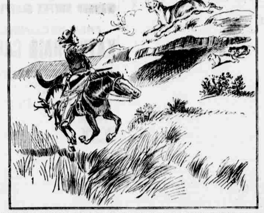
THE BALL FROM THE HUNTER'S REVOLVER CRASHED THROUGH ITS BRAIN.

The next morning we went to the cave and endeavored to catch the cubs, but all to no purpose. They were evidently feeding upon the skinned carcass of their mother, but on our ap-