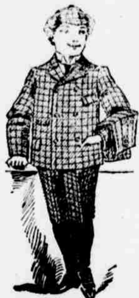
COMBINATION TERROR SUIT