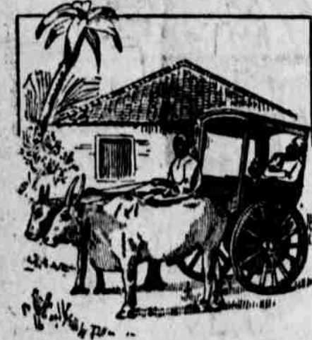
GOING TO MARKET IN INDIA.

At dinners and banquets each guest brings his own servant along, and the same is expected and paid for as at the hotels. During my stay at Bombay, which happened to be in the regular