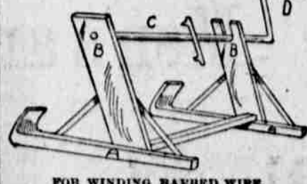
FOR WINDING BARBED WIRE. which have been very sore for

To take up barbed wire is a most disagreeable duty that has to be done on most farms where a temporary fence has been thrown around a crop for a year or two. Those who have done it by winding it back on the spool by hand, have torn and lacerated the lat-