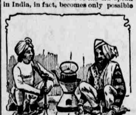
AT WORK IN AN INDIAN KITCHEN.

craze as hopeless and unreasonable as the opium craze elsewhere. The whole existence of the European