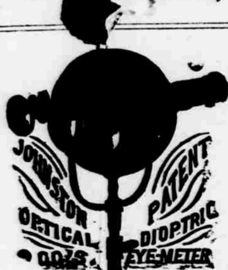
THE ABOVE CUT REPRESENTS