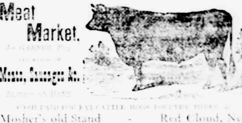
Mother's old Stand - Red Cloud, Neb.

1882 SPANOGLE & FUNK, HEAVY WEIGHTERS FOR AGRICULTURAL IMPLEMENTS, Two Doors South of Bank. RED CLOUD - NEBRASKA.